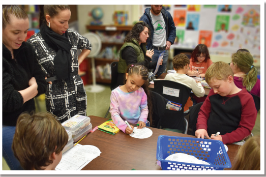
thankful for and played "Thanksgiving Celebration Bingo" Every 20 minutes they rotated so everyone had a chance to try the different activity stations manned by parent volunteers.

They also enjoyed an impressive array of snacks with sparkling apple cider to wash them down.